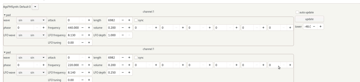
The frequency modulation synth screenshot