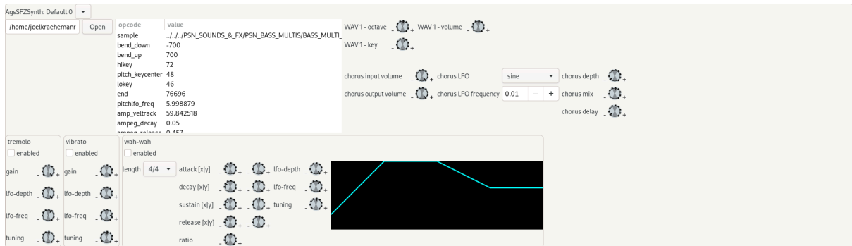
The SFZ synth screenshot