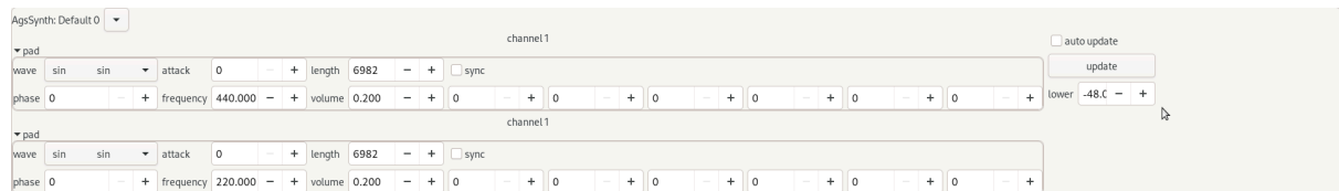
The synth screenshot

Produce audio data using its oscillators. The count of oscillators depends on number of input lines. They are adjusted vertically.