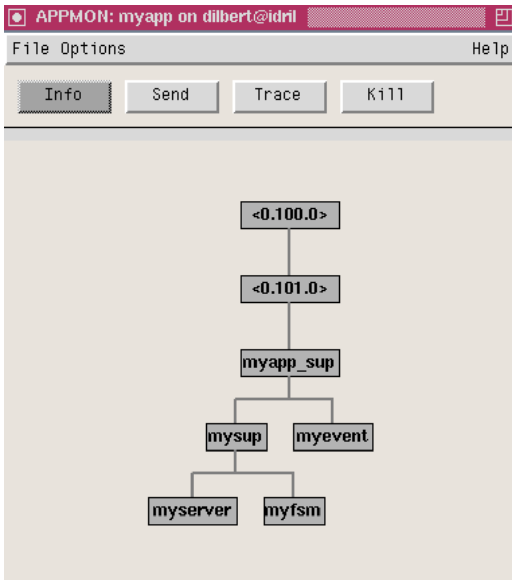
Figure 1.2: The Application Window.

The application can be shown either as a strict supervision tree, or as a process view with all linked processes. In supervision mode, the tree-gathering and -building algorithm assumes conformance to the OTP design principles.