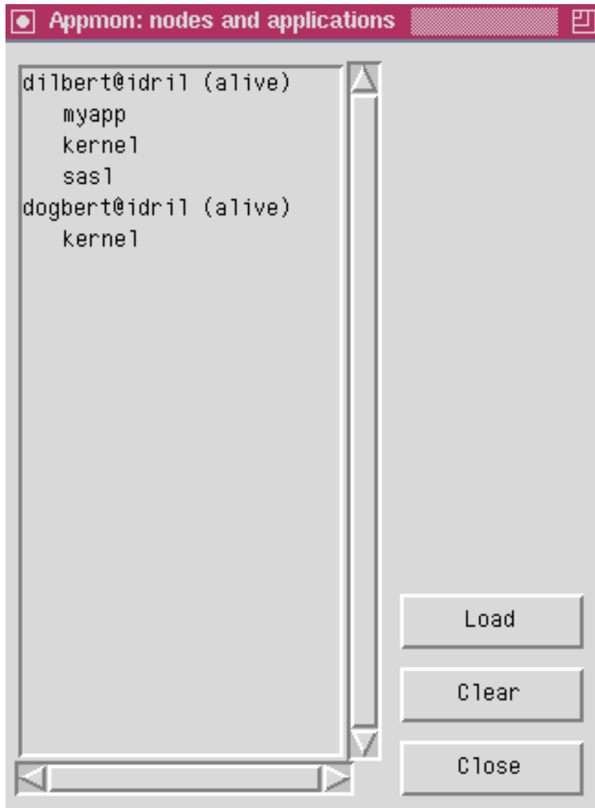
Figure 1.3: The Listbox Window.